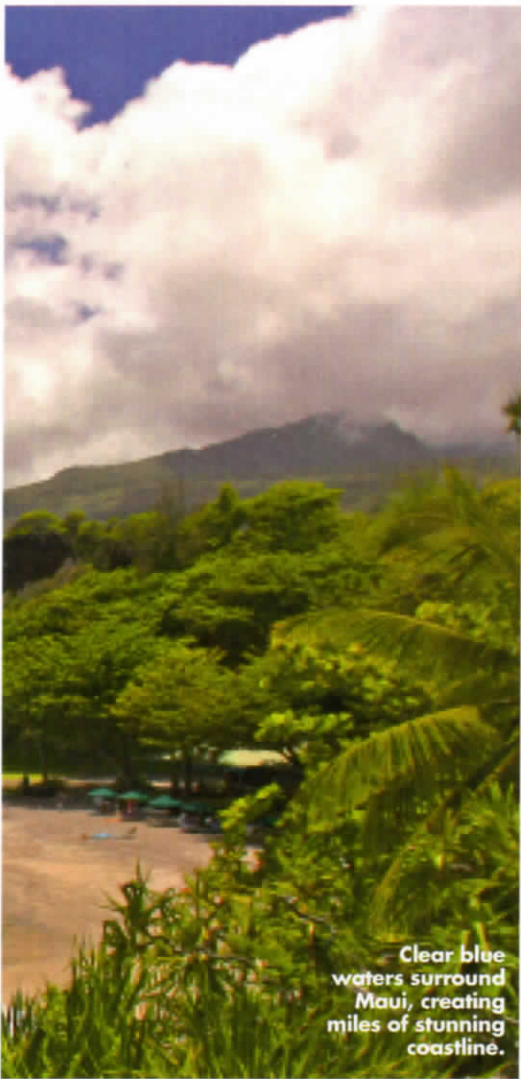
Clear blue waters surround Maui, creating miles of stunning coastline.